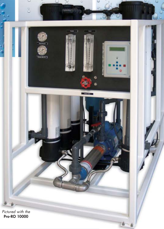
Pictured with the Pro-RO 10000